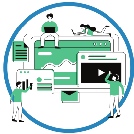
Backup Training Videos