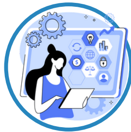
Industry Tools Mastery