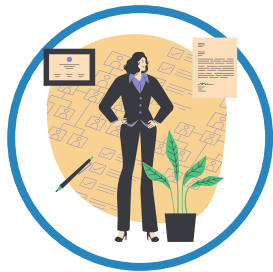
Job Placement Assistance