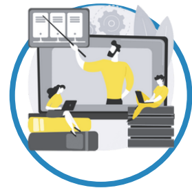
Practical Based Learning